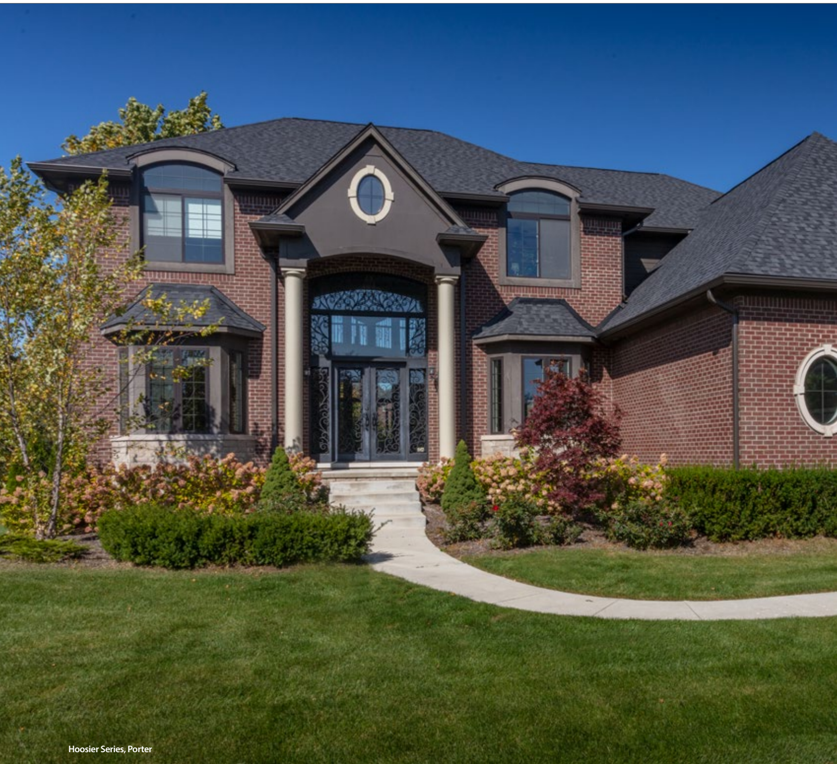
Hoosier Series, Porter

Named after "the Hoosier State" of Indiana, this brick series features unique color blends that enhance the beauty of Indiana clay, creating a stand-out home with an enduring stature.